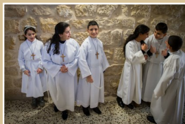
Altar servers before Mass in the Latin parish of Beit Jala.