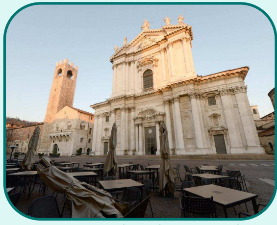
The desert square in front of the duomo of Brescia

Now there is a new phase, and it is lived with extreme cautiousness. The storm has not completely gone yet. Rightly, there is a lot of fear that the spread of the virus will return. Now is the time to reflect on how to cherish certain aspects of this lockdown especially from a spiritual viewpoint. There are tears, mourning, difficulties from an economical, social, relational, psychological and religious viewpoints. We have to start again.