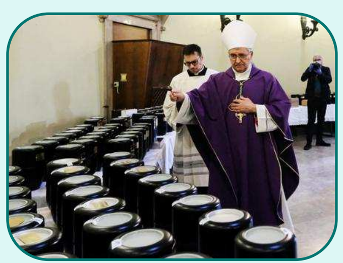
The bishop of Brescia blessing 300 urns

have been marked by a loss, and many others by a long, tiring and painful illness. We have been told that most probably the final and real number of deceased is at least one third higher than what was officially reported so far.